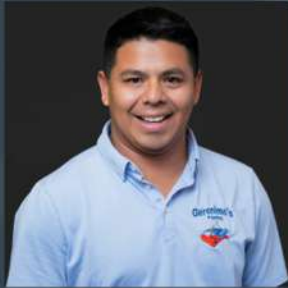
Jhony Geronimo Paint by Geronimo's