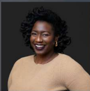
LaParis Hawkins Tailored Pieces